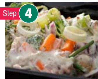
Step 4 Place into a display tray and garnish with fresh vegetables and La Spezia Herbs. Serve into black oven trays ready for sale.

For pie: Pre-cook the mixture until tender taking care not to overcook. Allow to cool slightly. Fill the mixture into a large foil of your choice. Place a puff pastry lid on top and either fork or thumb onto foil. Cut 2 – 3 slits into the pastry and glaze. Bake until pastry turns golden brown.