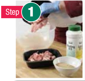
Step 1 Dice the chicken and place into a mixing bowl, sprinkle on pre-seasoning and DS Bond, mixing well.