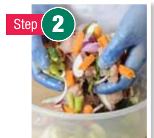
Step 2 Dice the vegetables and add to the meat. Mix well.