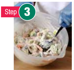
Step 3 Mix the sauces together, add to the meat and vegetables and mix well.